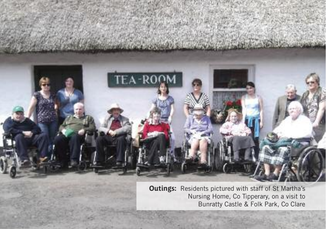
Outings: Residents pictured with staff of St Martha's Nursing Home, Co Tipperary, on a visit to Bunratty Castle & Folk Park, Co Clare

“For us, care is always about a person’s right to a warm and loving home and a meaningful life, connected to families and friends. Care is designed completely around the needs of our residents. We focus on making the transition from their home to Moorehall Lodge a positive experience by understanding how each new resident wants to live. We endeavour to get to know their needs and preferences, their life history, interests, likes and dislikes.