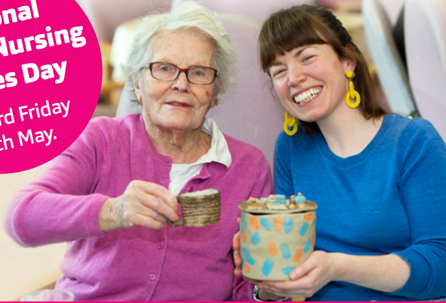
Image featuring the Fairland Collective and St. Joseph's Shankill, 2018

National Arts in Nursing Homes Day The 3rd Friday each May.